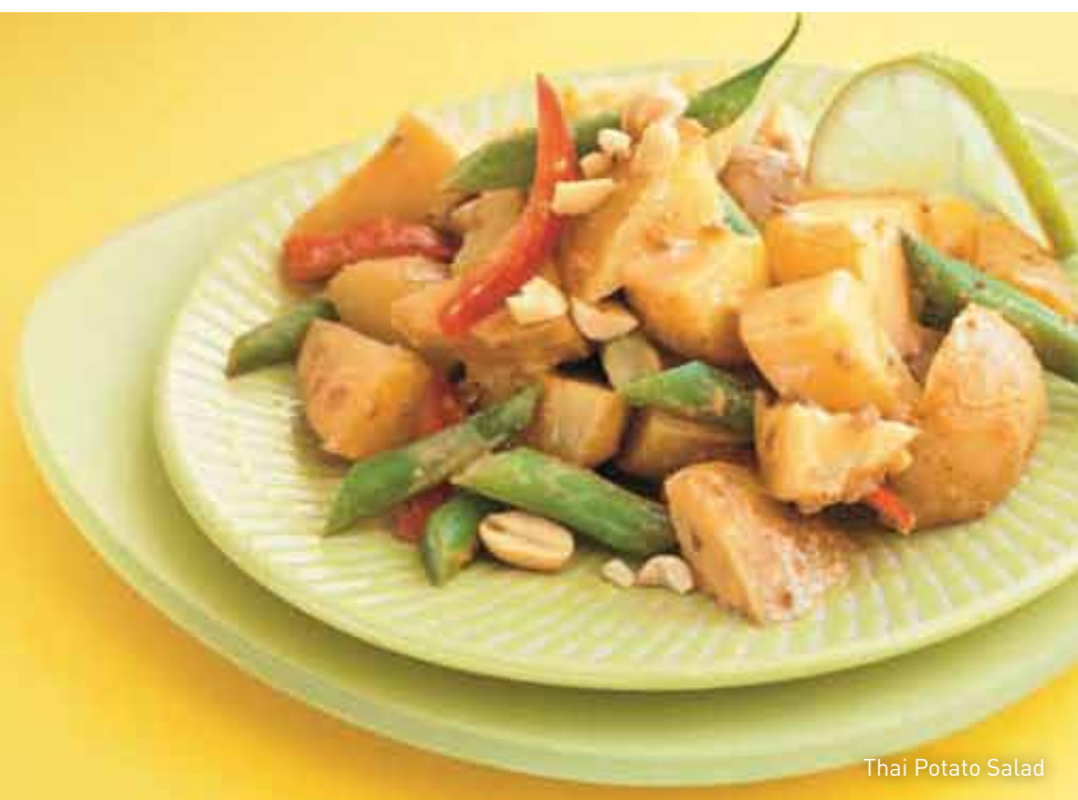
Thai Potato Salad

After years of consumer confusion about what constitutes a new potato, and after extensive industry-wide consultation, potatoes New Zealand has defined a new potato as “a young potato characterised by soft skin, so delicate it can be easily flicked off with your fingers”.