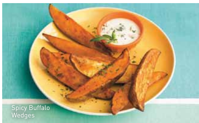
Spicy Buffalo Wedges