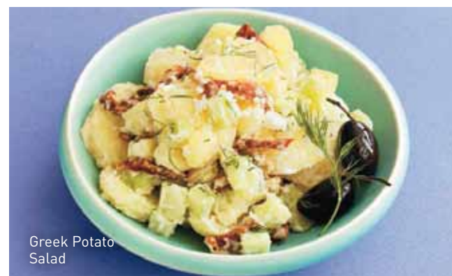
Greek Potato Salad