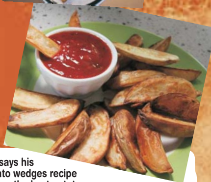
Sai, 11 Auckland

Claire shows you how to make great wedges. Click on the YouTube picture to view. Have a look and see how EASY it is!!!